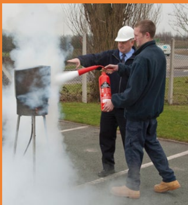
Expert training from the BFC

for our members... we provide our members with valuable networking opportunities, expert technical support and high quality training. We are committed to BSI and European standards and are represented on BSI committees, enabling our members to influence the standards of the future. Assistance is available for members to obtain BS EN ISO 9002 and to extend BAFE examination approval to registration, although this is not a mandatory requirement of membership. For more information visit our website or call the BFC secretary.